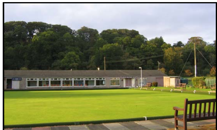
Lugar Bowling Club