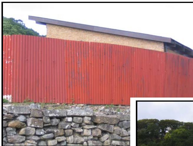
Lugar Football Ground

Litter/ fly tipping, condition and availability of car parking, facilities for teenagers, local heritage/ culture, public buildings, condition of footpaths/ pathways, environment around shops, play areas, woodlands, monuments, graffiti removal and community facilities (access to and quality of) are the aspects in frequency order that people are most dissatisfied with. People were satisfied with; woodlands, sports/ leisure facilities, street lighting and condition of footpaths/ pathways